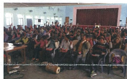
New bibles for 1st generation pastors in Varanasi, India