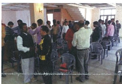
Activating pastors in healing ministry in Jaipur, India