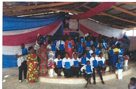
Bible Training Center students in Accra

It was a privilege to teach, encourage, equip and train our brothers and sisters in Christ there. A total of 165 first generation pastors were trained in Varanasi to start Bible Training Centers and another 49 in Jaipur. Based upon the commitments given there will soon be another 1500 students in weekly biblical study and practical ministry experience. The most exciting news though is there are thousands of home groups in the network of the key leaders and their desire is to have a bible school in each of them! I was also able to teach on one of my favorite topics and activate the pastors in each location in healing. Praise God!