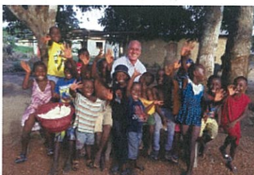
Having some fun with children in Sierra Leone, Africa